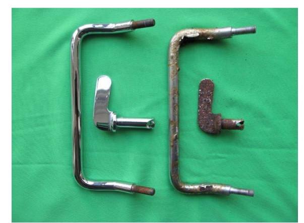
Comparing the refurbished and original chrome handles Before and after

Over 300 chrome 'D' handles, spacers and latches were removed over two days, all were badly corroded. Once removed the handles and latches were sent for re chroming and have now been