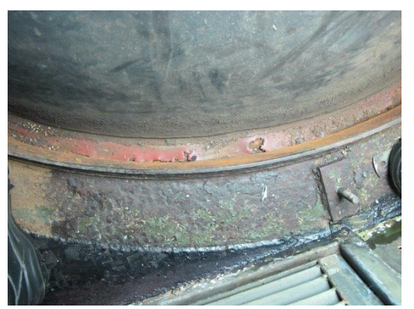
Corrosion around the pedestal ring