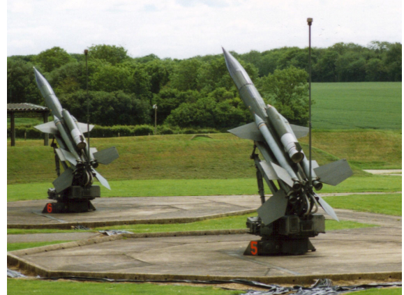
85 Sqn A Flt, Black Section, RAF West Raynham

The BMPG own a Bloodhound MKII Launch Control Post (LCP) and radar Type 86 (T86), both are currently under restoration.