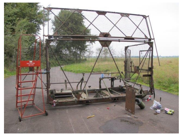
Work continues on the T86 Ae cage