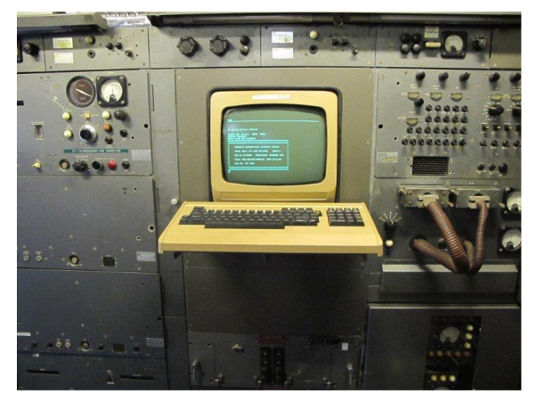
FT81 - Correct Display Refitted to L Rack in the LCP

The need to repair items such as the FT81 is a good example of the work now undertaken by the BMPG. In operational use a faulty monitor would mean an exchange of the item to maintain operational readiness. The situation today is that the BMPG have to maintain the simulator by fault finding to component level – on everything. Where a spare is available a swap out does happen to keep the simulator running but the faulty item then has to be repaired, to component level.