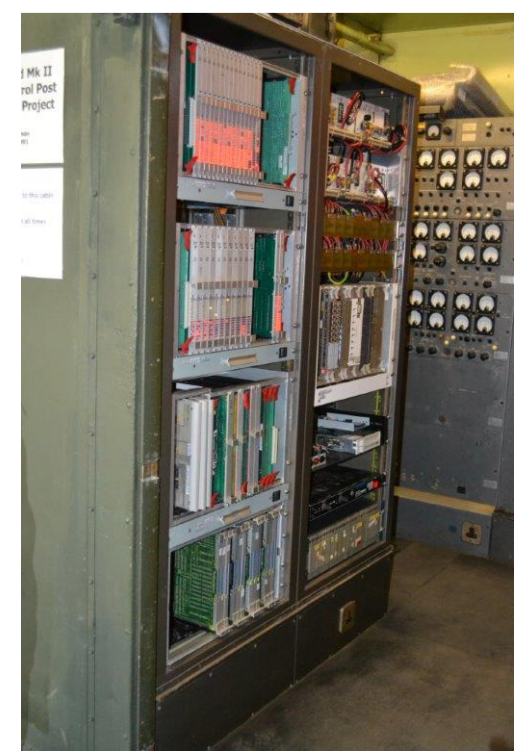
Computer Racks in the MK2A LCP

The work on maintaining the Argus 700 and the display