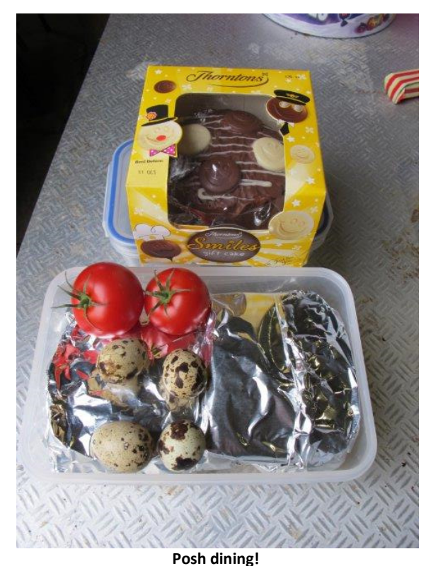
A first as quail's eggs appear in the lunchtime sandwich box