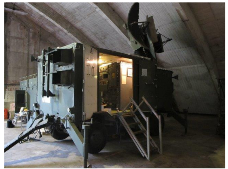
BMPG's Radar Type 86, ex 85 Sqn C Flt, Yellow Section Lights 'On'

One issue is that mains supply is now protected by an RCD. When the Type 86 was first designed it didn't matter too much if there was a bit of earth leakage, it does now! If you want to trip the RCD, switch on the