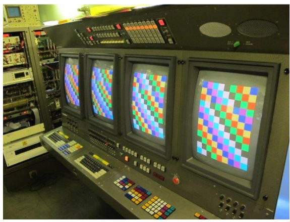
Display Console –CHARGE Testing A display that is not used operationally!

The four LCP/simulator's display VDU's are driven by Ferranti's CHARGE (Compact High-Resolution Advanced Raster Graphics Equipment) system. For the past year the display system has exhibited a few 'wobbles' from time to time usually in the form of software errors or the display sync being lost on one or more of the VDU's. After much head scratching and testing the problem was discovered to be the mains supply to the hangar in which the LCP is kept. Running the LCP and hence the Bloodhound simulator on a diesel generator, now for a second time in two months, has confirmed the display problems are due to a poor quality mains supply. The Bloodhound simulator ran