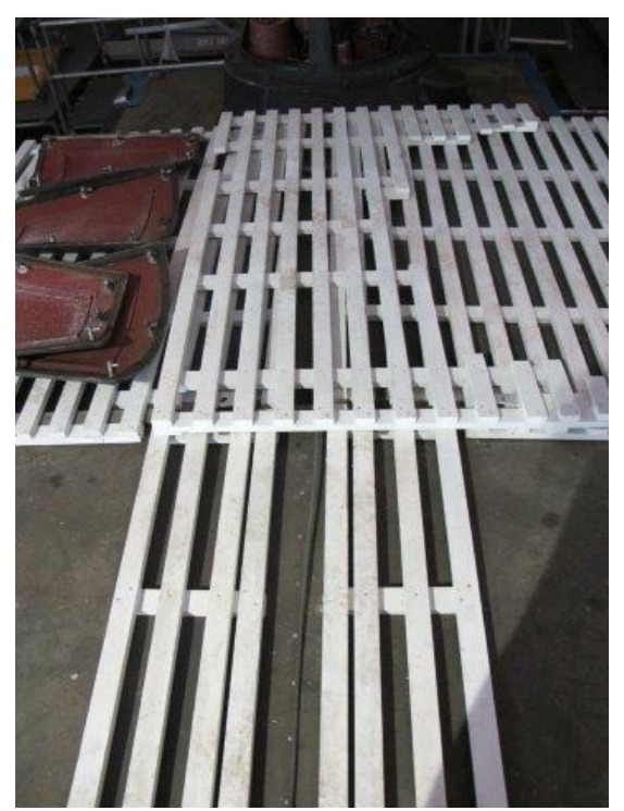
Type 86 cabin roof with decking being replaced

Talking about cabin roofs, both LCP and Type 86; they certainly are not strong enough to walk on without decking and both have a good number of rivet heads missing. It is obvious that over time the rivet heads have simply corroded off as water gets under them. Yet another job; re drill the rivet holes and replace.