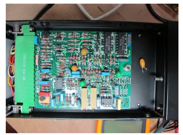
Power Supply G15-16S – Control Card Bead tantalum capacitors also changed as a matter of course when a fault develops on the control card

The faulty power supply was a Farnell G15-16S giving 0V output instead of the rated +15V DC. Experience has shown that any fault (so far) on a Farnell G series power supply shuts down the output.