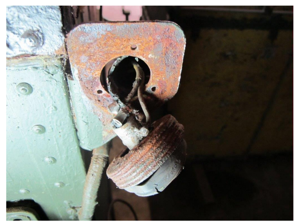
Radar Type 86 running light Unbolted from its mounting bracket

A minor item but important to the overall presentation of the radar.