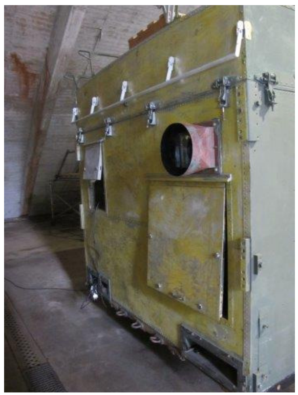
End wall of LCP cabin Showing some of the chrome locking key covers

There is also a balance to be had with restoring the LCP cabin. Should the LCP be made to look 'new' or as it would look after 27 years of RAF service?