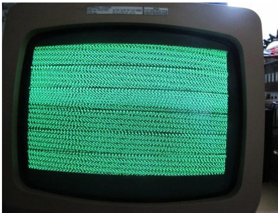
FT81 - Faulty Display Not exactly readable!

The system monitor is now serviceable again following several hours of fault finding which resulted in the replacement of a faulty 74 series TTL device on the monitor's video card. The video card is based on the Z80 microprocessor design. Ferranti used the Z80 almost exclusively for the Argus 700 Input/Output (I/O) cards and the FT81 video card, anywhere that some processing was required. Being able to fault find Z80 microprocessor systems is a must.