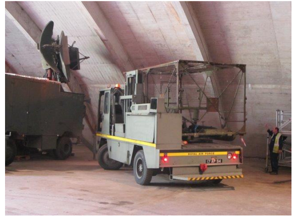
The 'cage' arrives following unloading from its road transport