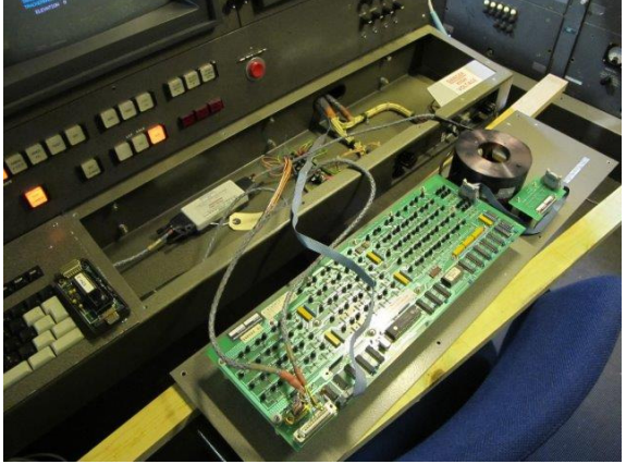
Trackerball and E.C.'s keyboard Removed and inverted for fault finding

A recent but minor fault with the Bloodhound simulator was the Engagement Controller's tracker ball. The tracker ball would initially move the display marker in the horizontal plane and then stopped moving altogether. The fault was eventually traced to a poor connection in the 8 Port Serial Line Drive unit in the Argus 700's I/O rack. The +5V supply to the tracker ball encoder dropping to +3.5V, not enough to drive the TTL used by the encoder. The poor connection was down to oxidisation on a spade terminal in the line drive card. It is not surprising that oxidisation causes problems, before being acquired by the BMPG the LCP was exposed damp, even wet, conditions for twenty two years.