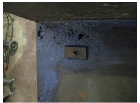
Corrosion in the mild steel sheet - pedestal roof section

The degree of corrosion is shown in the photographs below. Fortunately, it is the thin mild steel sheet that has corroded through and all load bearing points are still sound. Treating the corroded areas will eventually involve the cutting out and welding in new plate. For now the corroded plate has been treated with an anti-corrosion solution.