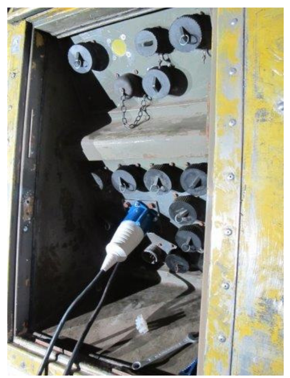
Industry standard 32 Amp plug and socket

Where essential 'non original' items are replaced the policy is to retain the original items so they can be re fitted if and when required.